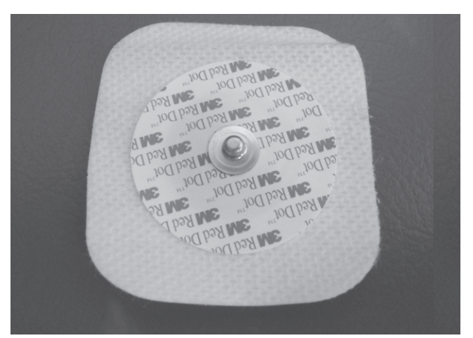
Figure 1 A suitable ECG dot.

Following decannulation, closure of the tracheostome is imperative for successful phonation. The current accepted method of closure is through the use of an occlusive dressing over several layers of eye-pad gauze. It is universally recognised that the occlusive dressings never provide a sufficient seal and an air leak invariably occurs when coughing or talking. Many patients strug-